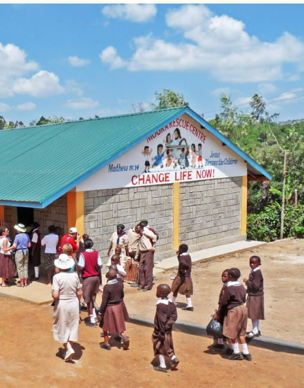
Life Now" emblazoned on the gable, this assembly of the community, speaks to the generosity of the

we have talked about this through the years, there is no way to adequately paint this picture. But we intend to try! WE ARE SO GRATEFUL TO