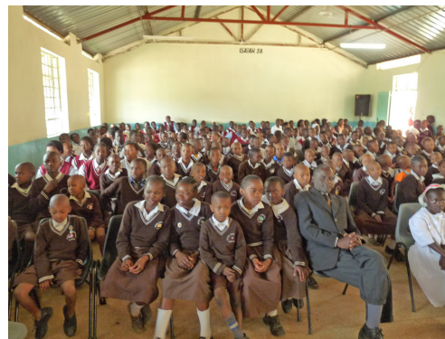
Inside Pommerenke Hall, the children of the new orphanage, teachers and guests enjoy the Dedication.

you the story of their life on the streets... and then walk with them into the slums, to their cardboard and tin homes, where death, crime, hunger and filth are their constant neighbors. You have walked with us, joined us in this mission, and trusted us to bring your love and hope into this place that is covered with tremendous darkness. We have tried