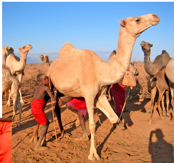
Rendille boys milking camels at sunrise.

starving to death, disease rampant. But God is The fence was needed to protect the children from walked home.