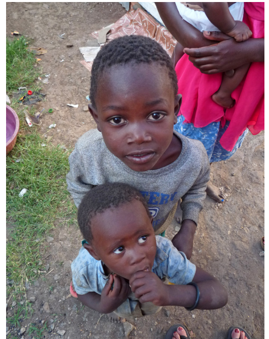
Some of the children of the Mathare slums.

in Nairobi. We met joy by surprise! It's one thing to see pictures of far away lands and wonder about the reality of the situations described. It's another to look into the eyes of a child as they tell