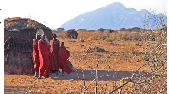
Women of the Rendille Tribe outside of a manyatta.

Five years ago was our first opportunity to meet the Rendille people. It is estimated that there are about 30,000 Rendille, living in villages called manyattas throughout the Korr desert, on the border of Ethiopia and Kenya. They are camel herders, and because they are surrounded on four sides by enemies, when they have attempted to move to more fertile lands, they are often killed. When they are not in drought, they may have maize and beans added to their sparse diet, but mainly they exist on camel's blood mixed with camel's milk.