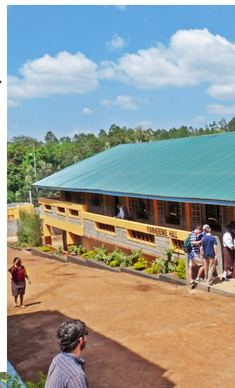
With "Change hall, the heart donors.

And the children of Mogra will never doubt that angels walk the earth.